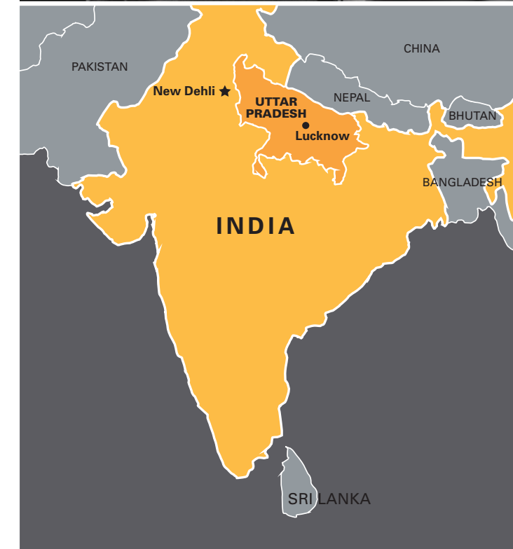
Sources: United Nations Development Program, Government of India Press Note on Poverty Estimates 2011-12, Uttar Pradesh Annual Health Survey Bulletin 2011-12